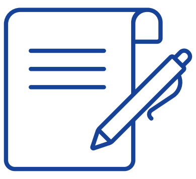
ODA will be monitoring bills related to oral health

The challenges of navigating dental insurance are perennial concerns that we hear from members. Some of the challenges members have shared are with assignment of benefits, retroactive denials, and prompt pay. After research and discussion, the RAC recommended